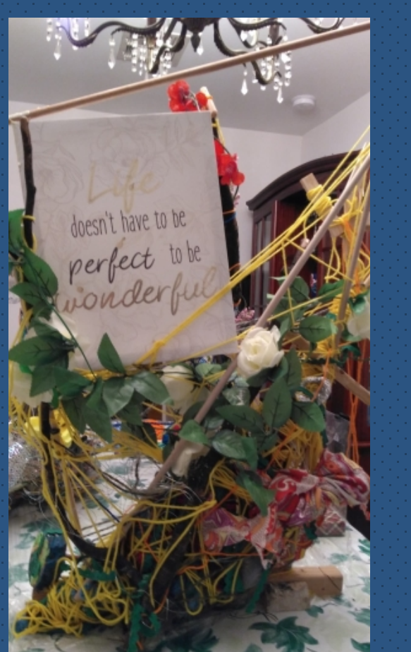
Life is Wonderful